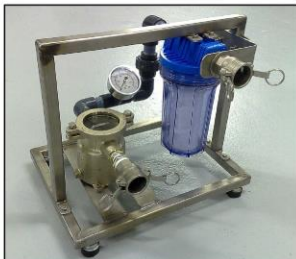
Portable filter bracket with pressure indicator and quick-connections.