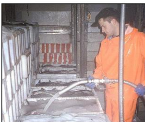
Thick Multi-Ice pumped from buffer tank at sea.