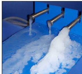
Variable process water flow results in different ice concentration.