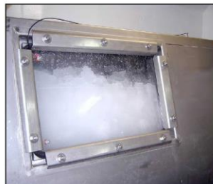
Thick Multi-Ice at 40% concentration stored in a insulated buffer tank.