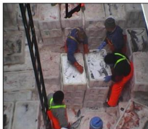
Fresh fish in boxes landed after 14 fishing days.