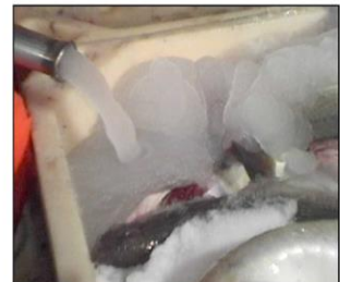
Up to date Multi-Ice delivery on demand for fresh fish chilling in tubs at sea.