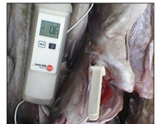
Average temperature in fish after 2 weeks in Multi-Ice.